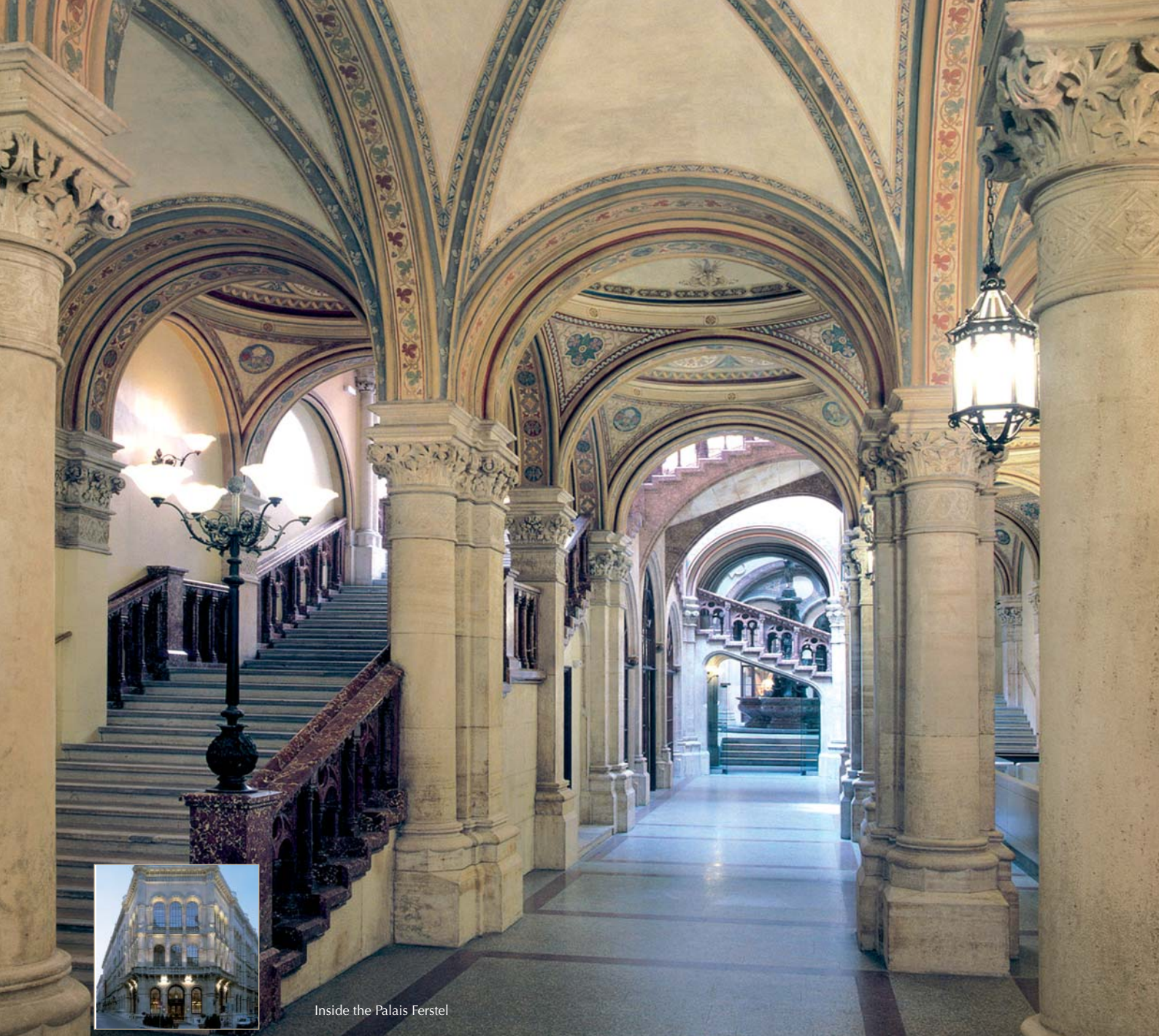
Inside the Palais Ferstel